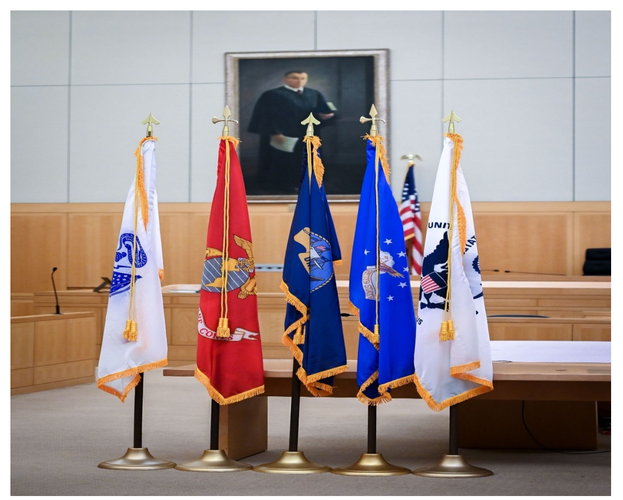
Flags standing in the courtroom at the Veteran's Treatment Court in White Plains, Westchester County.

DPP also participates in ongoing special projects, such as the continued rollout of UCMS, particularly the Treatment Service Module into our Supreme and County courts. DPP also recently launched the UCS's elder justice website which provides judges and court personnel with information about the prevention and recognition of elder abuse and neglect, available legal interventions, relevant criminal and civil laws, guidance relating to the special needs of older adults, and a comprehensive database of elder justice resources.