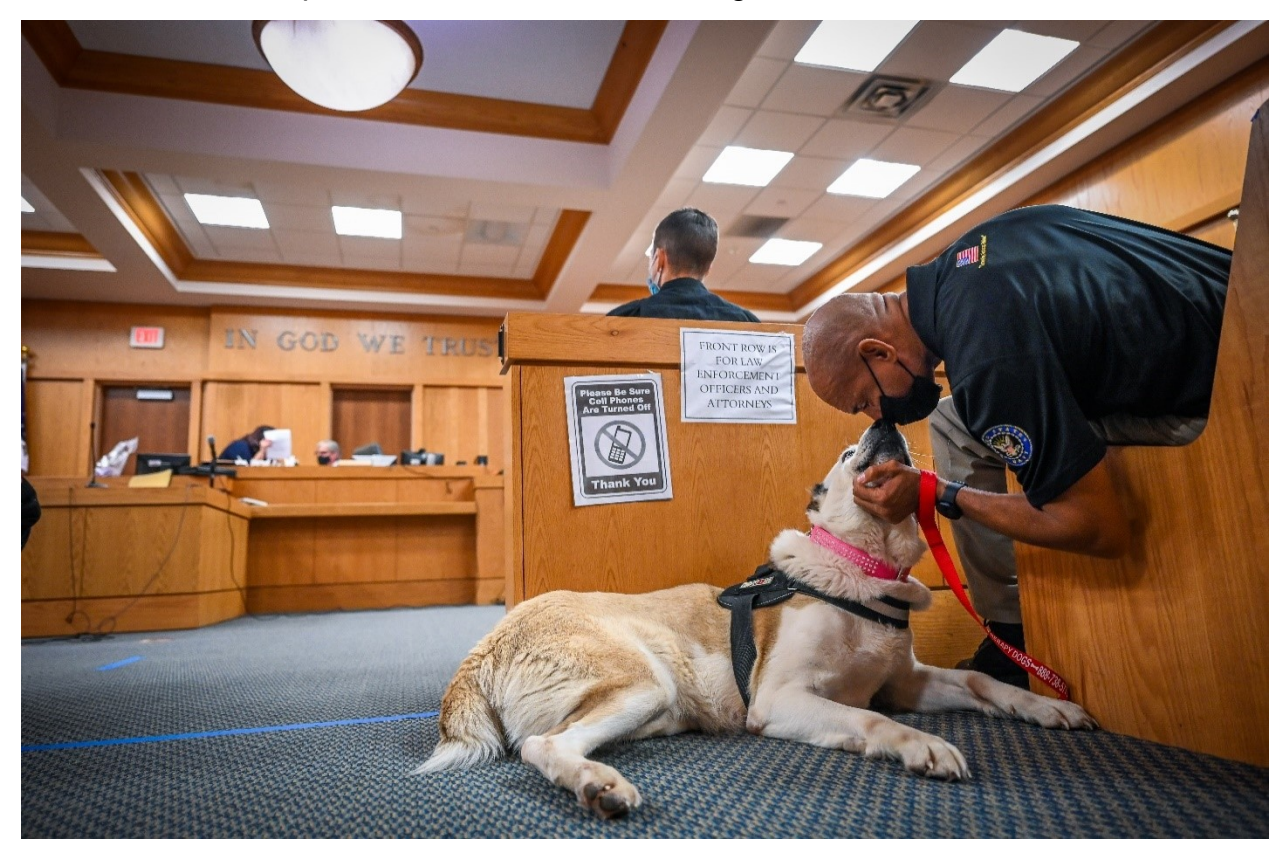
A photo of the Veteran Treatment and Drug Court in Newburgh, Orange County.

Two additional appendices provide further information on problem-solving court resources and best practice standards in adult drug courts.